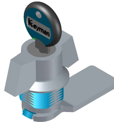
KP 1.16 (LOCKABLE)