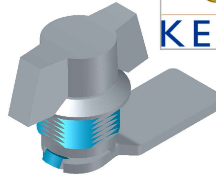
KP 1.15 (NON LOCKABLE)